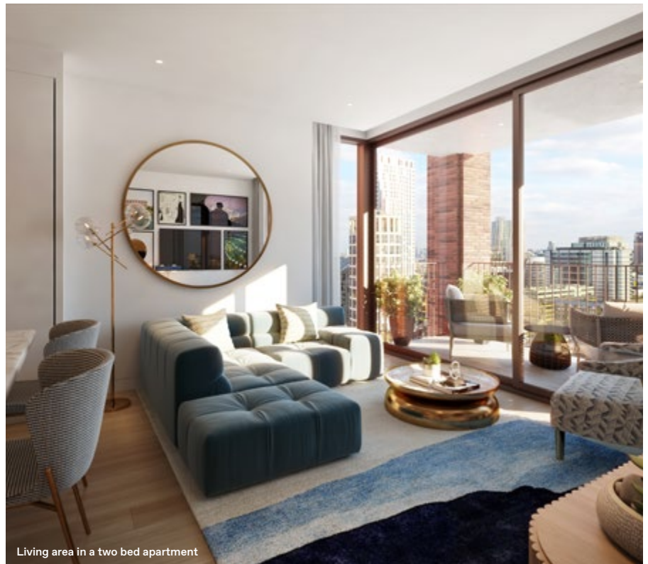
Living area in a two bed apartment