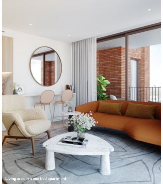
Living area in a one bed apartment