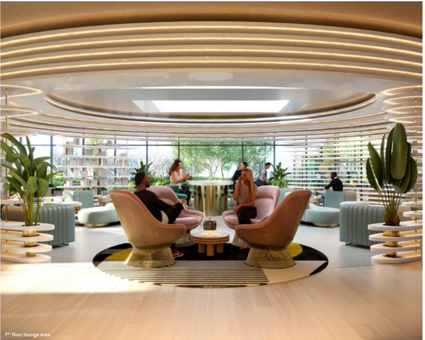
7 th floor lounge area