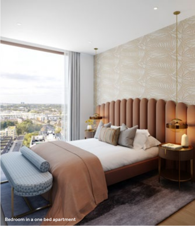
Bedroom in a one bed apartment